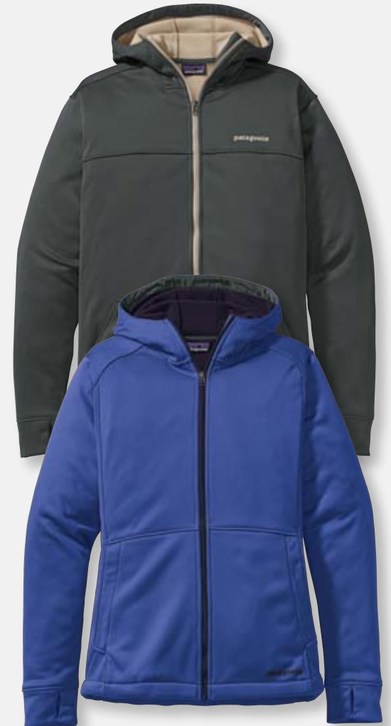
M'S SLOPESTYLE HOODY forge grey