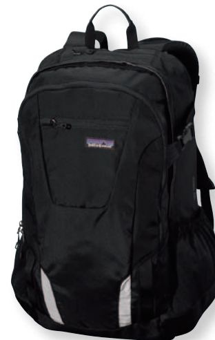
AYSSEN PACK - P6 black