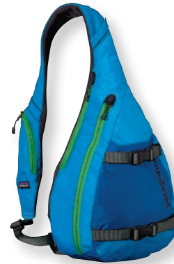
ATOM larimar blue