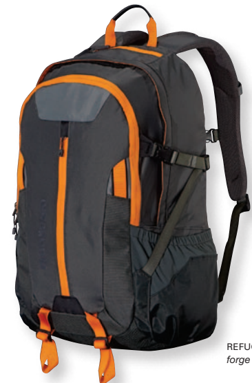
REFUGIO PACK 28L forge grey