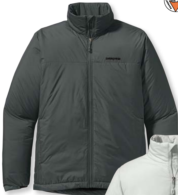
M'S MICRO PUFF JACKET forge grey