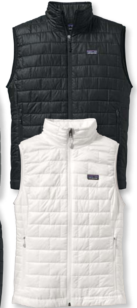
M'S NANO PUFF VEST black