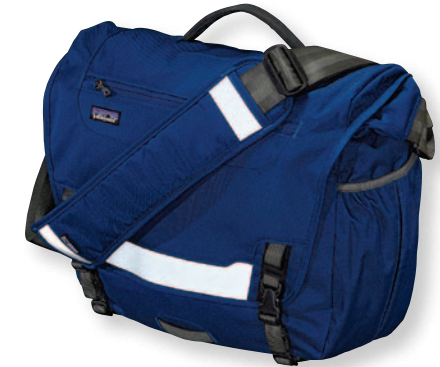
HALF MASS - P6 channel blue