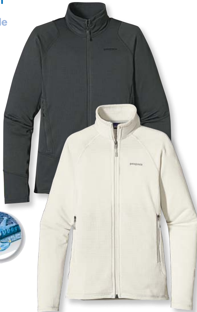
M'S R1 FULL-ZIP JACKET forge grey