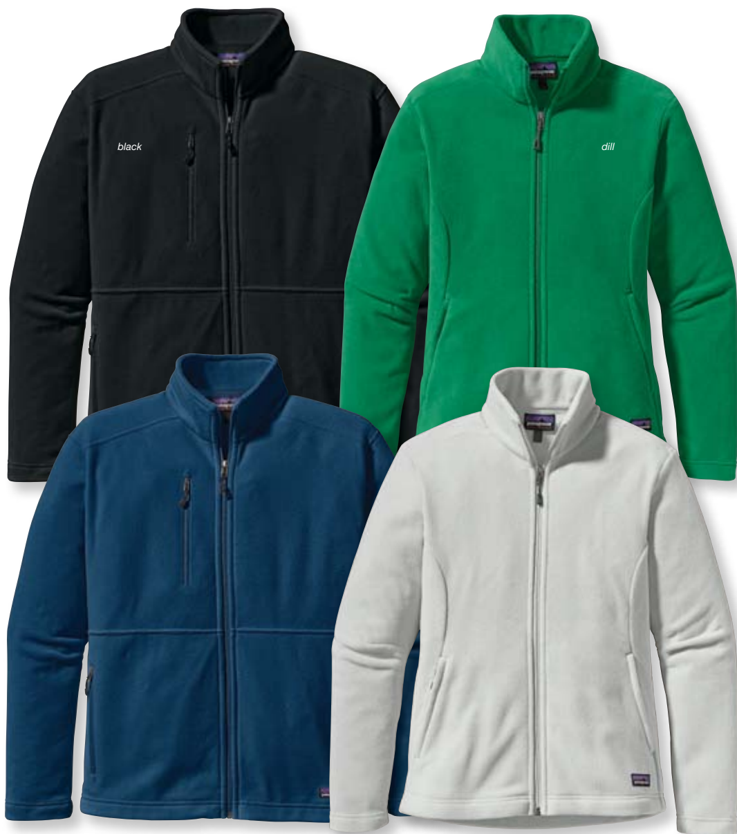
M'S MICRO SYNCHILLA JACKET classic navy