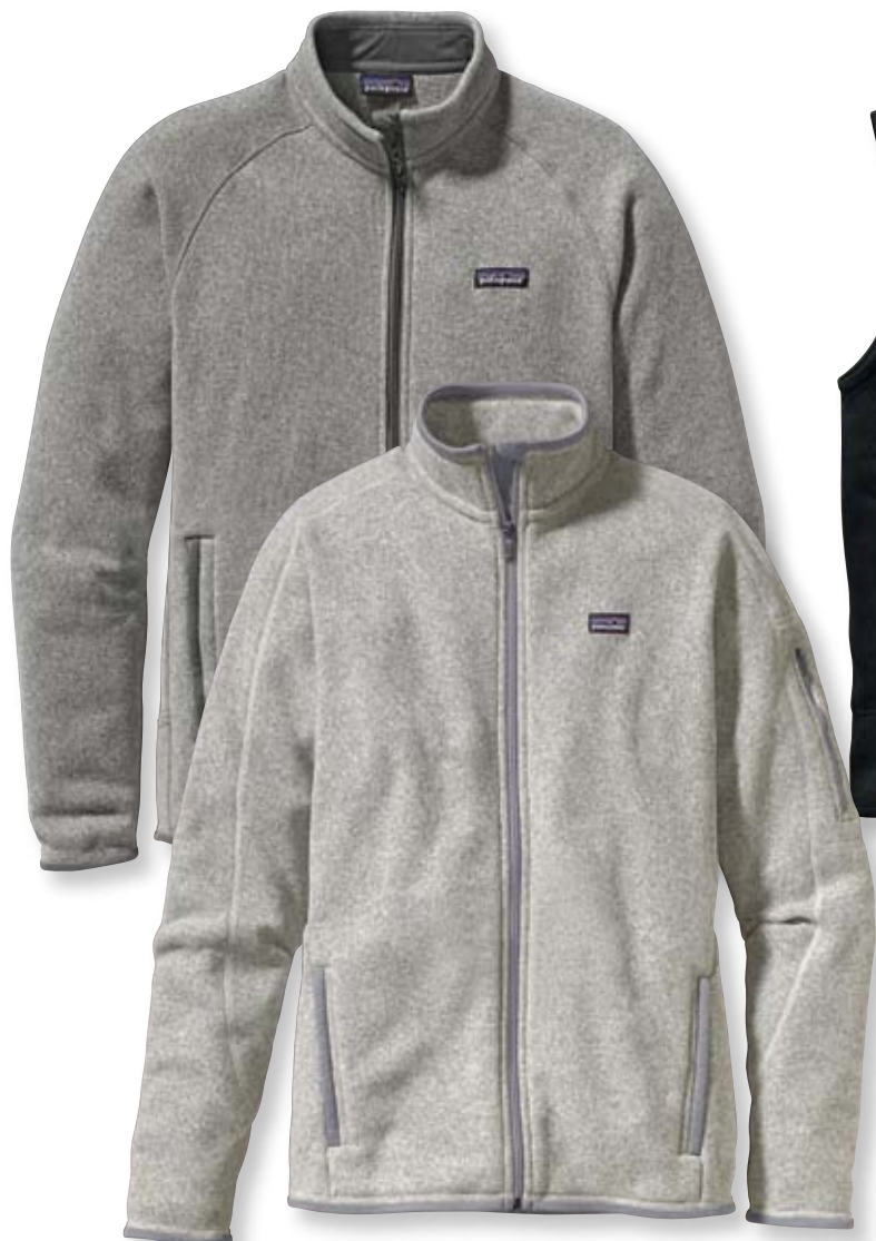
M'S BETTER SWEATER JACKET stonewash