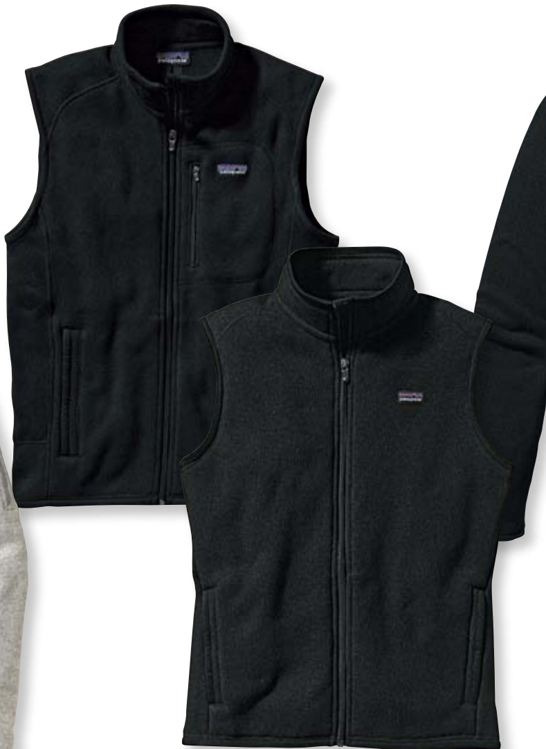
M'S BETTER SWEATER VEST black