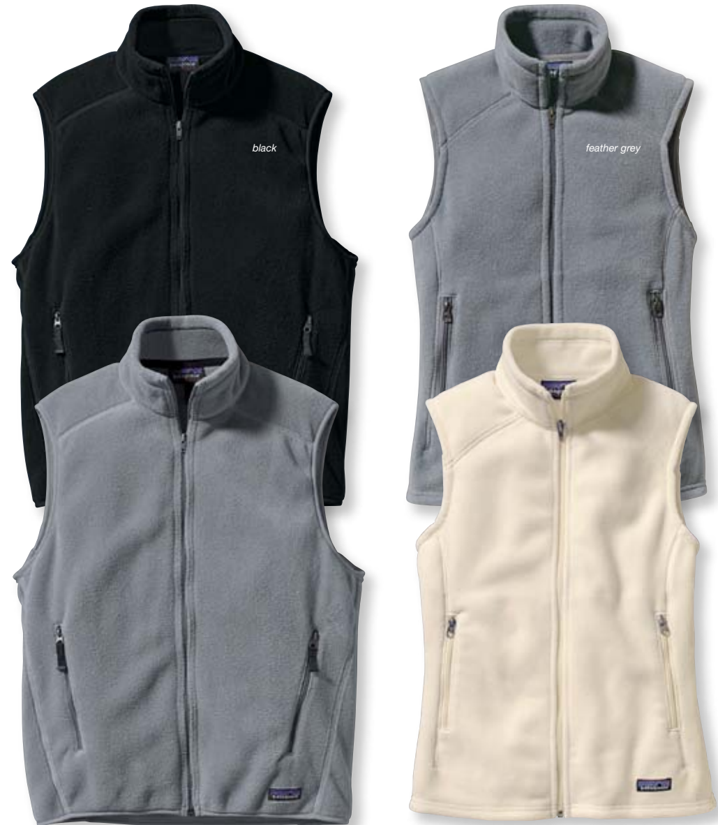
M'S SYNCHILLA VEST feather grey