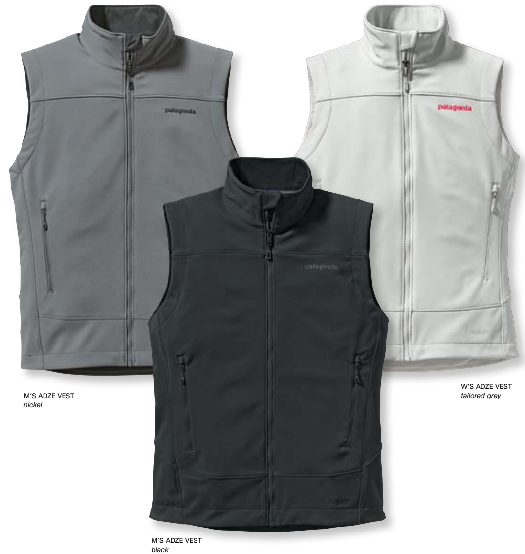
M'S ADZE VEST nickel