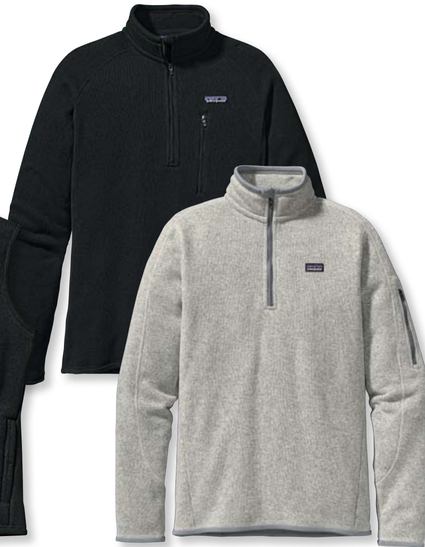
M'S BETTER SWEATER 1/4-ZIP black