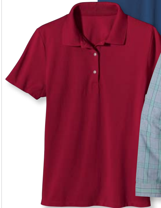
W'S PERFORMANCE PIQUÉ POLO real red