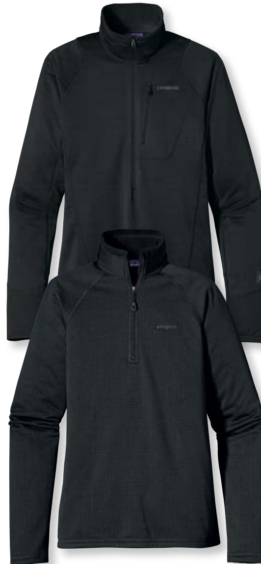
M'S R1 PULLOVER black