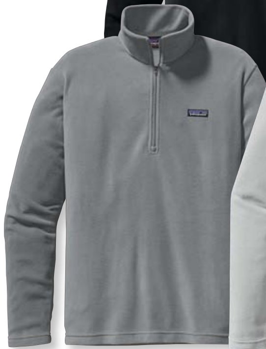
M'S MICRO D 1/4-ZIP nickel