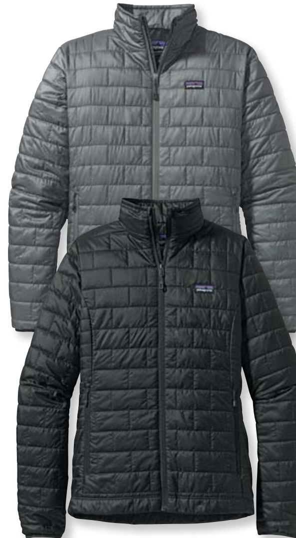
M'S NANO PUFF JACKET nickel