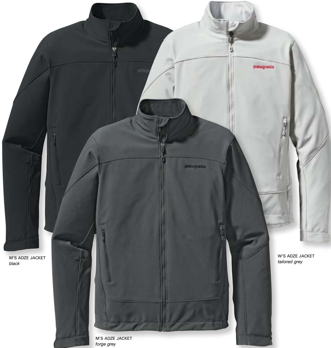
M'S ADZE JACKET black

Built with Polartec® Windbloc® fabric, our durable Adze Jacket & Vest provide total protection from the wind.