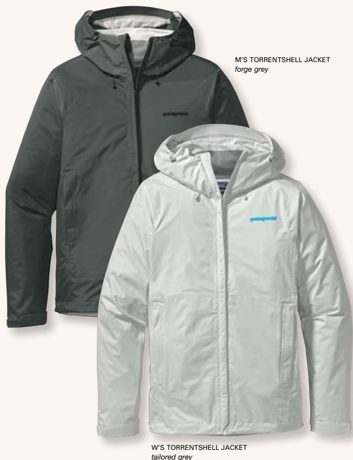
M'S TORRENTSHELL JACKET forge grey