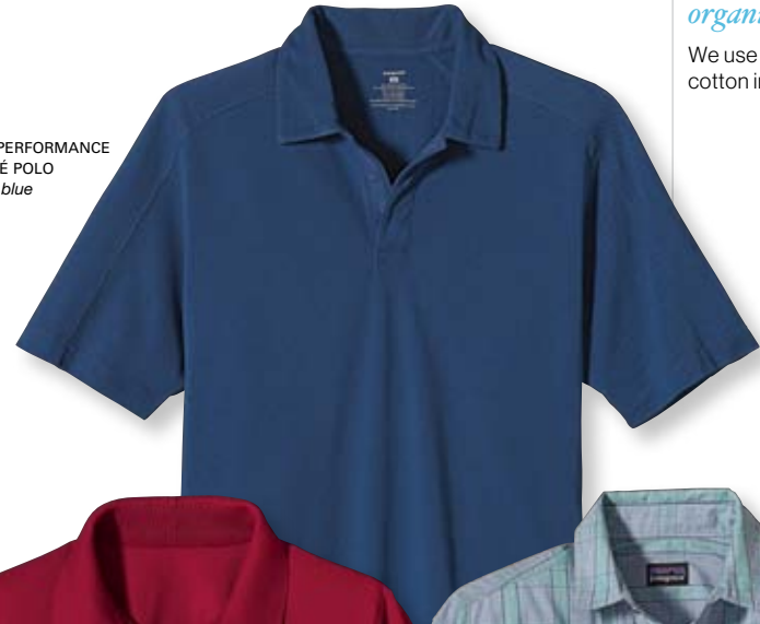
M'S PERFORMANCE PIQUÉ POLO orbit blue

We use 100% organically grown cotton in all of our cotton products.