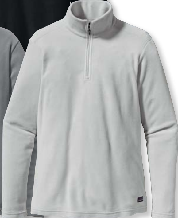
W'S MICRO D 1/4-ZIP tailored grey