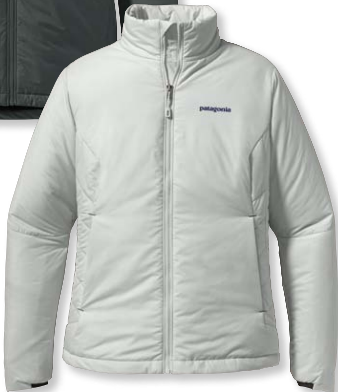
W'S MICRO PUFF JACKET tailored grey