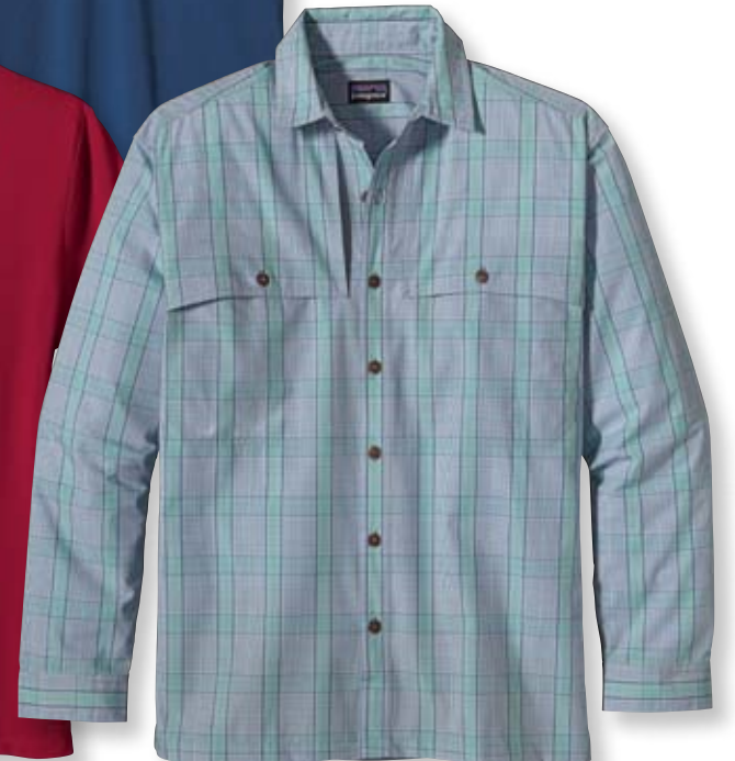
M'S LONG-SLEEVED ISLAND HOPPER SHIRT gordon: railroad blue

*The UV protection of the Island Hopper is rated as "good" when tested in accordance with Australian/ New Zealand test methods AS/NZS 4399 or AATCC 183/ASTM 6603/ASTM D6544.